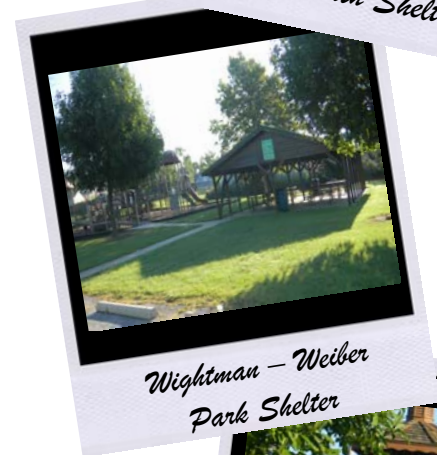
Wightman - Weiber Park Shelter