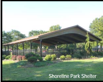
Shoreline Park Shelter