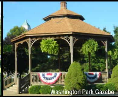
Washington Park Gazebo