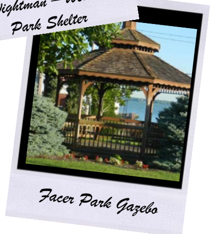
Facer Park Gazebo